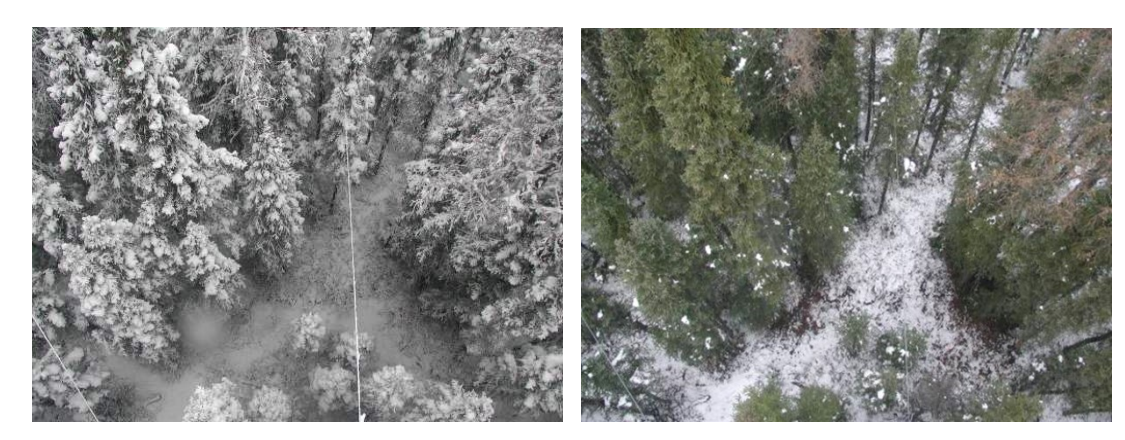
Figure 2.1: Tower-based forest canopy photos showing viewable snow that is very similar to snow on ground (left) and viewable snow that is less than snow on ground (right).

Fractional snow extent is calculated only for cloud free land areas, open water areas (inland and oceans) as well as glaciers and ice sheets are masked using a common land mask.